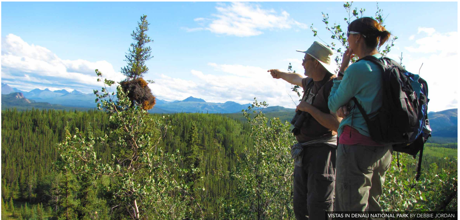
VISTAS IN DENALI NATIONAL PARK BY DEBBIE JORDAN