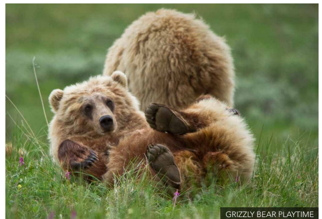
GRIZZLY BEAR PLAYTIME

This light adventure showcases Cordova's remarkable biodiversity and geology, but also includes cultural exploration plus urban discovery in Anchorage. The leisurely pace begins with an overnight stay in Anchorage, followed by six nights in Cordova, plus a final day back in Anchorage. You'll explore several ecosystems, with daily hikes over variable terrain, including a Sheridan Glacier ice-trek. The most strenuous hike is 6.1 miles (roundtrip) on Heney Ridge, along boardwalks and trails that are occasionally muddy or rocky. It features one steep uphill climb with an elevation gain of 1333 feet. For this, you'll break into small groups based on level of intensity. Other activities include wildlife viewing and birdwatching; kayaking on Prince William Sound; a five-mile Alaganik Slough canoe trip; and an Orca Inlet boat trip. The highest altitude reached is 1349 feet. May through August is the best time to travel, with average highs between 52.5–61.3°F, and the least precipitation. Besides your roundtrip air transfer to Cordova, there is one flightseeing tour, plus overland travel via private minivans.