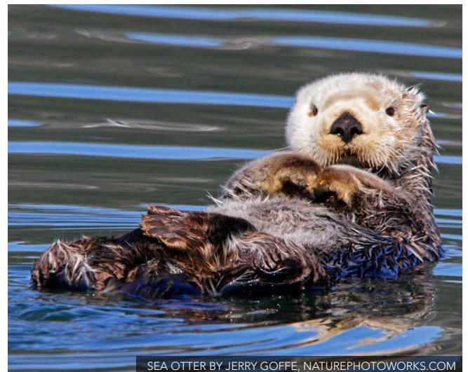
SEA OTTER

After breakfast, take a boat trip to the panoramic Orca Inlet for the opportunity to see the world's largest population of sea otters and observe their interactions within the pod. Your guide for the day has been involved in sea otter studies for 15 years. Afterward, stop at a remote beach for a short hike to explore tide pools. Then head to Hinchinbrook Island for lunch at another beautiful