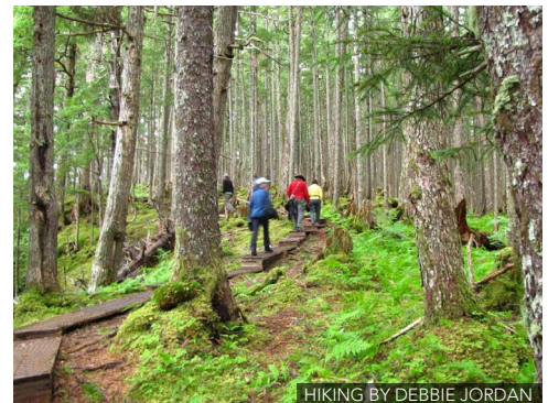
HIKING BY DEBBIE JORDAN