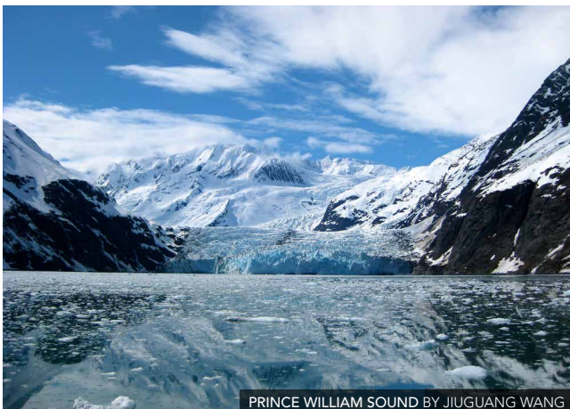
PRINCE WILLIAM SOUND

This program includes optional carbon offsetting with ClimateSafe. Learn more at holbrooktravel.com/climatesafe